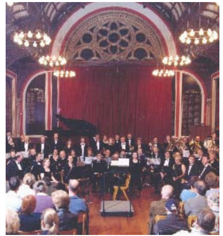
Southwark Concert Band at the Great Hall, Dulwich College.