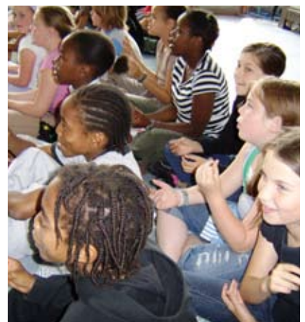
Goose Green Primary School pupils enjoy the music.

Students throughout south London are reaping the benefit of the Making Music Training Grant awarded to South London Community Music (SLCM) in 2007.