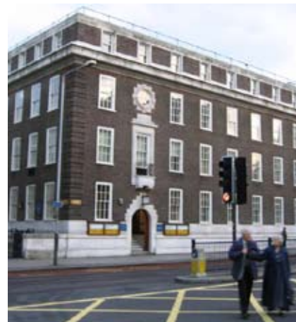
Friends House, London

London Harmony is also available in a large print format Contact Making Music: 0870 903 3780