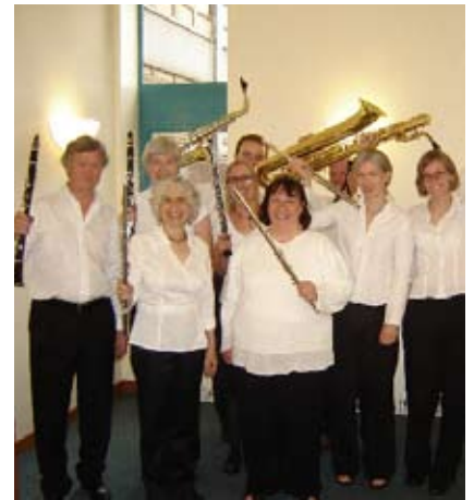
Members of the Bloomsbury Woodwind Ensemble out of the rain at the Marie Curie Hospice in Hampstead Summer Fayre in 2007

For further details visit our website www.bloomsburywoodwind.org.uk